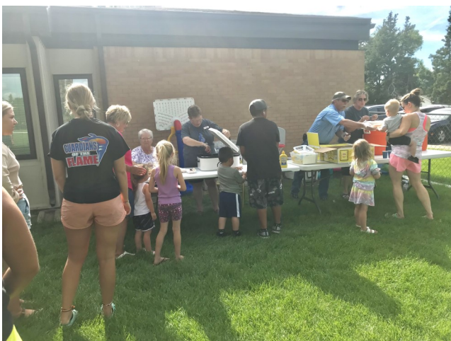
Serving God and loving our community!

Thank you to all of you who helped in one way or another this season. We look forward to continuing our tradition of connecting with our community neighbors again next year!